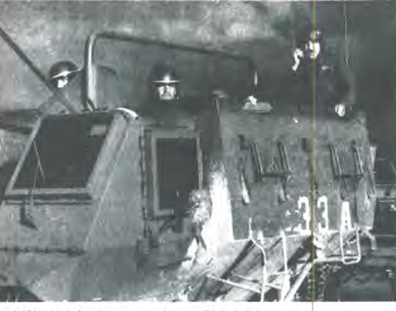
South African blacks face these goons everyday - our solidarity is vital

This refusal by the AAM to make trade union sanctions central to the Anti-Apartheid campaign flows directly from its commitment to the popular front policy of the African National Congress, Outside South Africa this means placing the emphasis in solidarity work not on the working class but on creating alliances which can pressure "progressive" (and not so progressive!) capitalist governments to implement sanctions against South Africa, Criticism in Britain therefore, of the trade union leadership or the Kinnock leadership of the Labour Party for their criminal inaction on the question, must be avoided at all costs. So too must rank and file trade union actions be avoided lest they discomfort these gentlemen, The leadership of the AAM, heavily staffed by Stalinist fellow travellers of the South African Communist Party and ANC, will do everything in its power to prevent this strategy being disrupted. Early in the AAM's annual general meeting the platform made it clear that it was more interested in the defeat of one of its major opponents inside the AAM, the City of London Anti-Apartheid group, than it was in discussing effective trade union action. Delegates were faced with undemocratic chairing. Only after a demonstration by City supporters, the adjournment of the conference and negotiations, was there a proper card vote on a